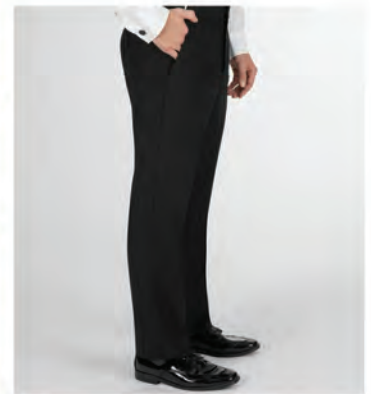
Modern Slim Fit Pants a stylish alternative to traditional trousers