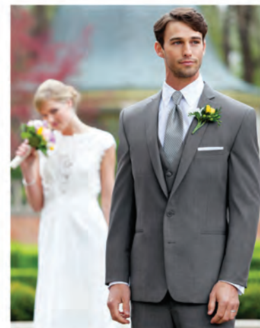
Grey Dillon Slim Fit Suit by Stephen Geoffrey / 312