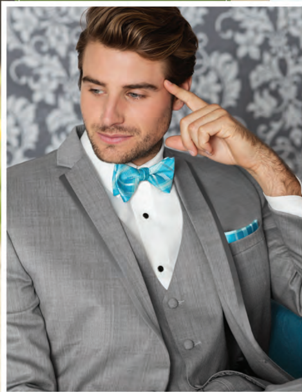
Manhattan Slim Fit Tuxedo by Tony Bowls / 930 shown with a black fullback vest