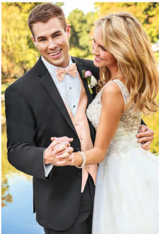
Expressions Fullback Vests, Ties & Pocket Squares. Available in 39 colors!