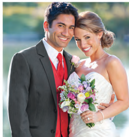
Grey Ceremonia Slim Fit Suit by Jean Yves / 352