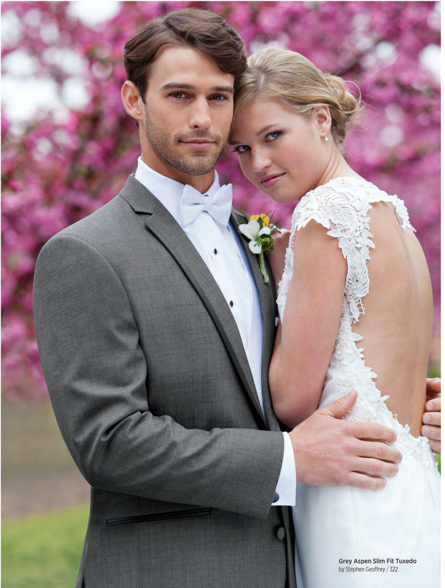
Grey Aspen Slim Fit Tuxedo by Stephen Geoffrey / 322