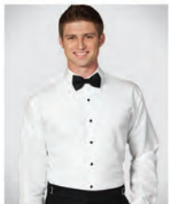
Fitted Formal Shirts in black, white & ivory