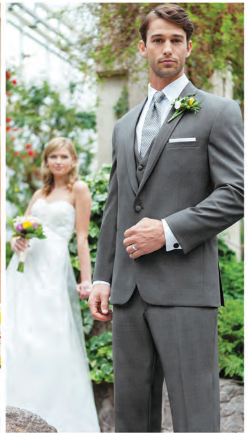
Grey Aspen Slim Fit Tuxedo by Stephen Geoffrey / 322