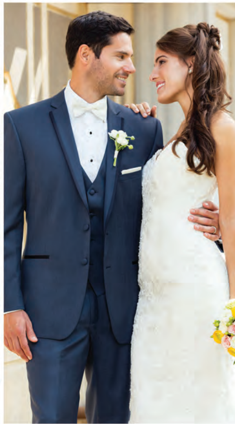
Slate Blue Aspen Slim Fit Tuxedo by Stephen Geoffrey / 382