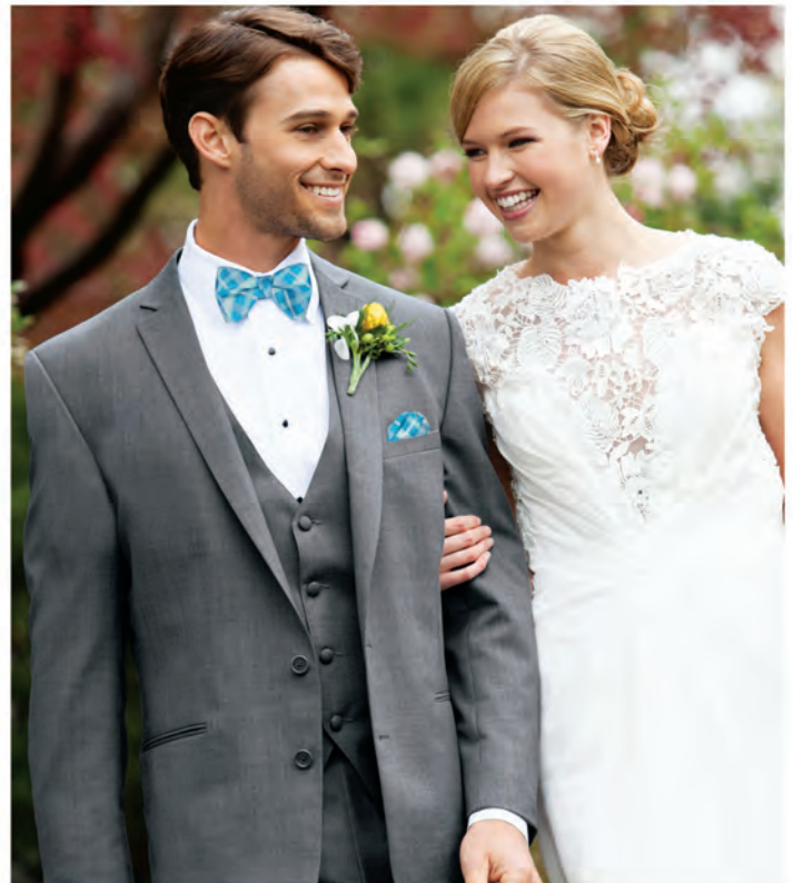
Grey Dillon Slim Fit Suit by Stephen Geoffrey / 312