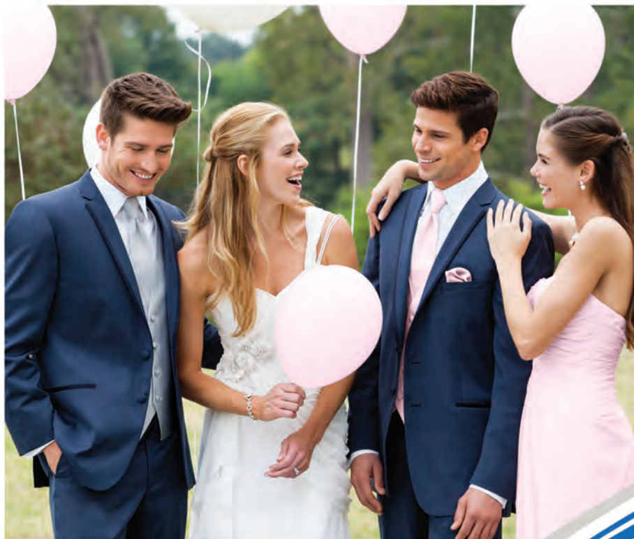
A multitude of color choices allow you to custom coordinate the accessories for every member of your wedding party.