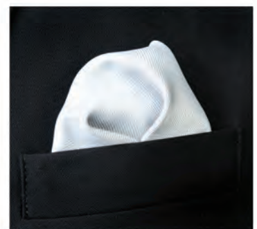
Pocket Squares find a color to match every vest and tie