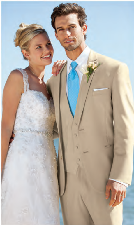
Havana Slim Fit Suit by Lord West / 252