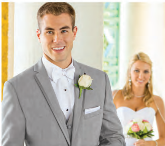
Heather Grey Aspen Slim Fit Tuxedo by Stephen Geoffrey / 362