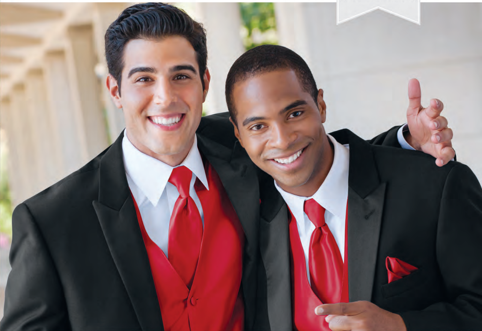
Saville Tuxedo by Lauren Ralph Lauren / 962

Trust the Largest Formalwear Network with your Wedding