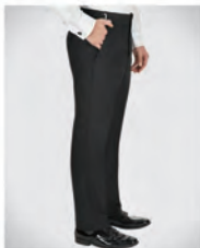
Modern Slim Fit Pants