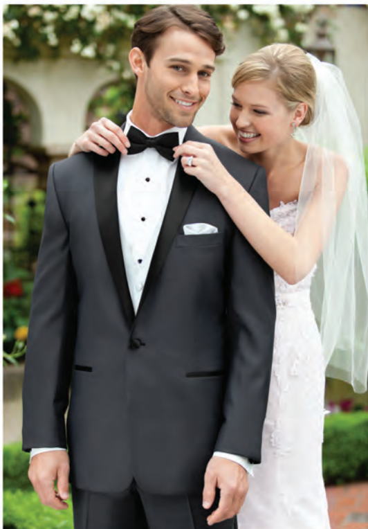
Grey Portofino Slim Fit Tuxedo by Tony Bowls / 301

Choose from a number of finely tailored grey styles to reflect the mood of your wedding. Light, medium, and dark greys are available - pair them with vibrant colors to make a splash or subtle colors for a classic look.