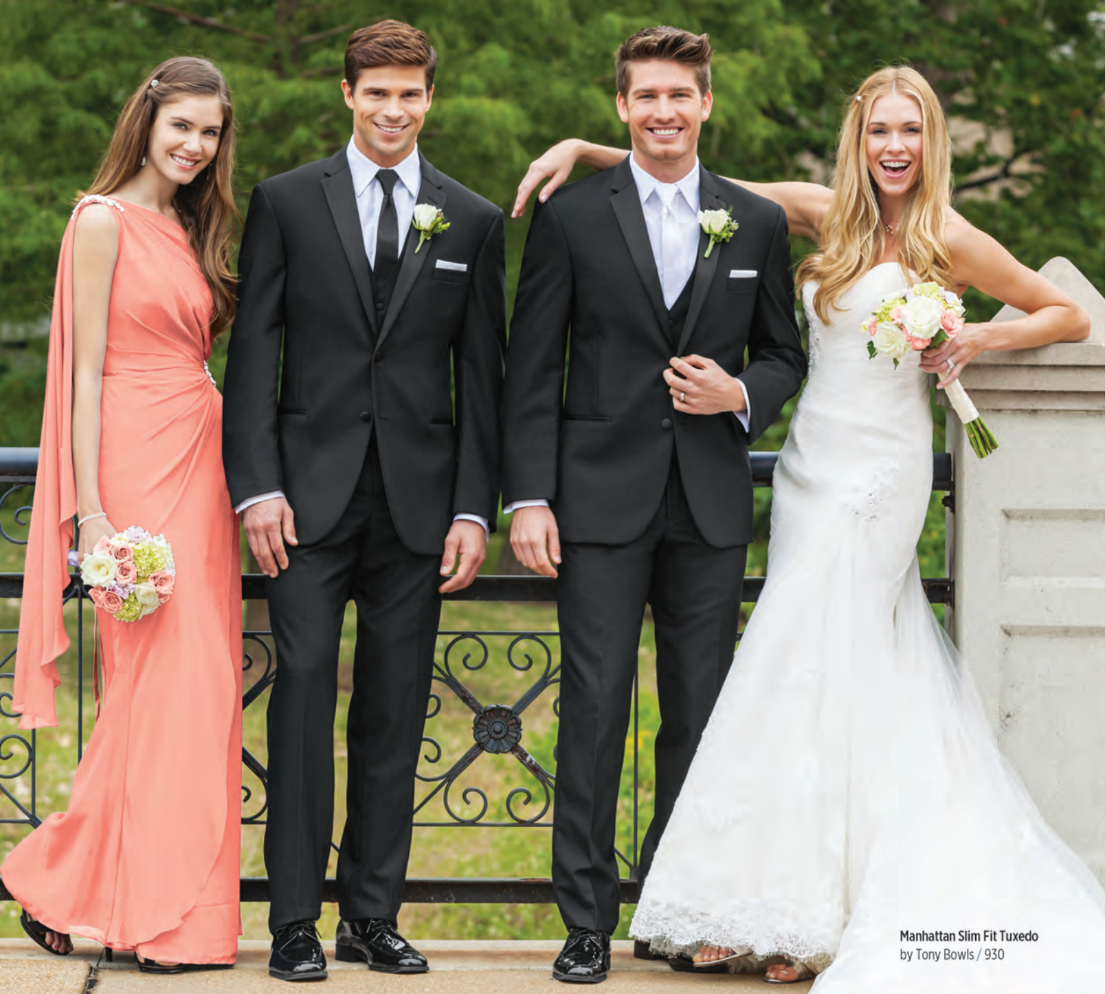
Manhattan Slim Fit Tuxedo by Tony Bowls / 930