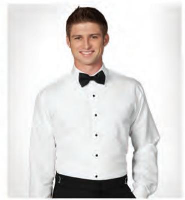
Microfiber Fitted Formal Shirts available in black, white and ivory

Items shown are for purchase only: Plaid Bow Ties available in 9 colors Novelty Suspenders available in 16 colors Formal Socks available in 12 colors