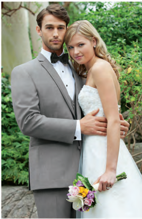
Heather Grey Aspen Slim Fit Tuxedo by Stephen Geoffrey / 362