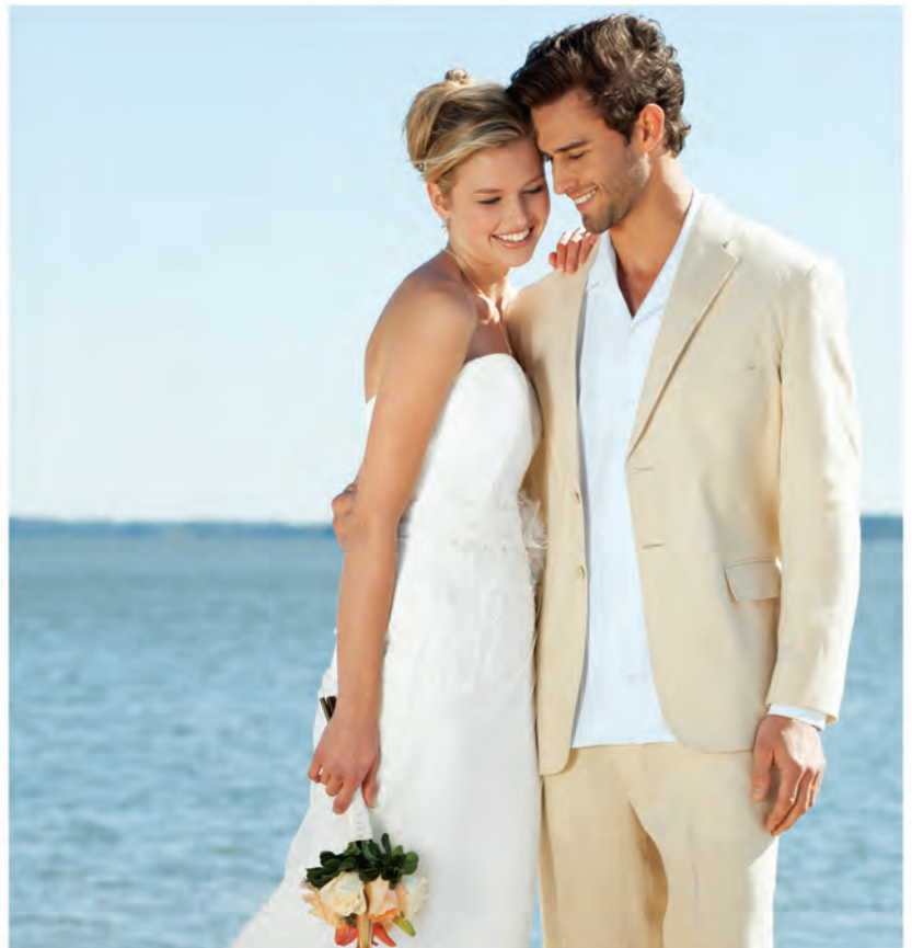
Riviera Destination Suit Coat by Stephen Geoffrey / N25