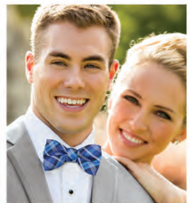
Plaid Bow Ties add a splash of color with these fun bow ties