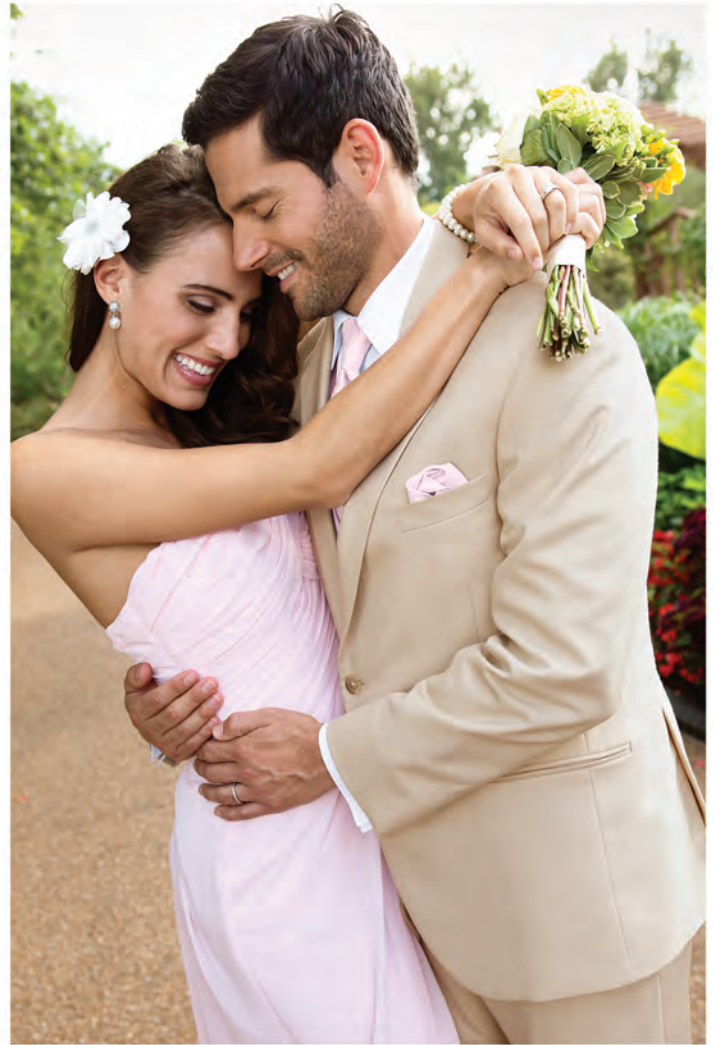
Tan Havana Slim Fit Suit by Lord West / 252