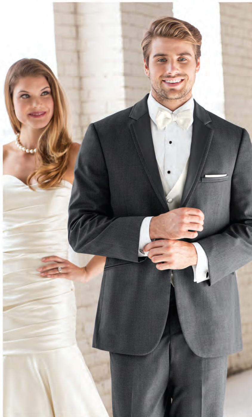
Steel Grey Tuxedo by Jean Yves / 342